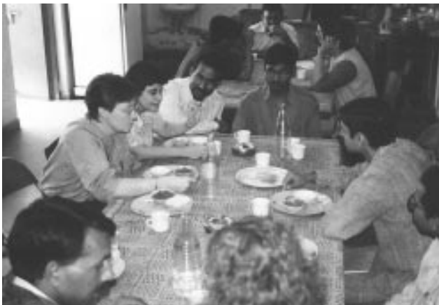
Informal discussion with JNU faculty and graduate students.