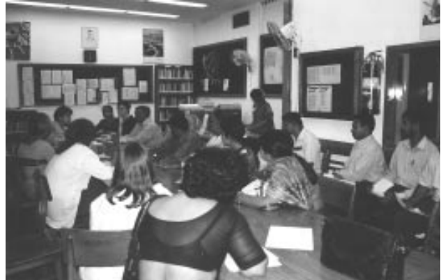
The IFUSS delegation meets with members at the South India American Studies Network in Chennai.