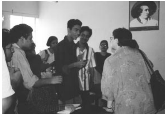
JNU students and the Co-Directors in lively debate.