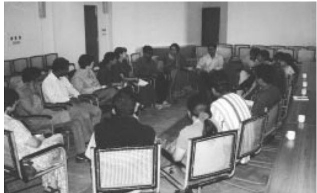
Participants in the workshop "Alternatives for the Youth in the 21st Century" arranged by Alliance for a Responsible and United World at JNU in Delhi.